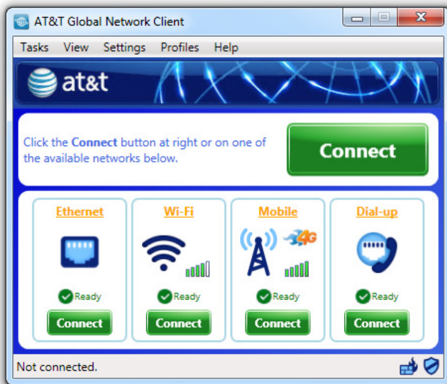
Figure 1: Main Window

The AT&T Global Network Client is software that allows Windows computers to easily access the Internet and your company's private network from many locations around the world. It provides a simple, powerful interface that automatically detects and connects over mobility, Wi-Fi, broadband, dial, and ISDN networks . It also provides security policy enforcement, offline access-point directory browsing, detailed connection history, and in-depth diagnostic logging.