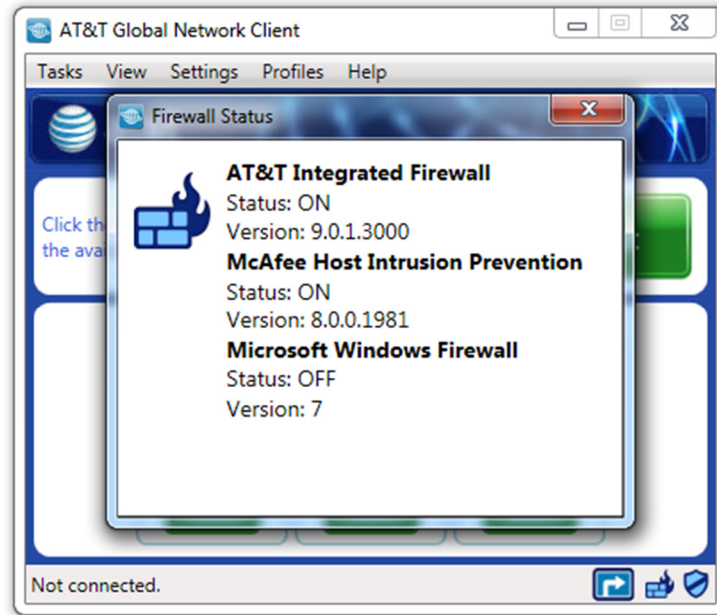
Figure 3: Firewall Status Info

Click on the icons in the Security Status panel of the Main Window to open a pop-up window with useful information related to the icon topic.